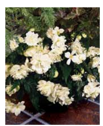
Pendular Begonia Avalanche

Because they originate from tropical forested regions, they require warm growing temperatures and bright shade, with some protection from midday summer sun. Best results will be achieved using a humus rich, well-drained growing medium.