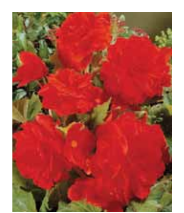
Camellia Begonia Firestorm