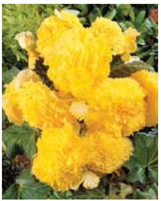
Fimbriata Begonia First Light

There are many different types of begonias available, in a wide range of colours and forms. The most common types are Pendular – suitable for hanging baskets; Non-Stop – ideal for garden borders; Fimbriata and Camellia flowered – perfect for large pots.